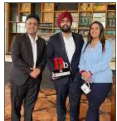
BEST EDUCATION BRANDS THE ECONOMICS TIMES 2023