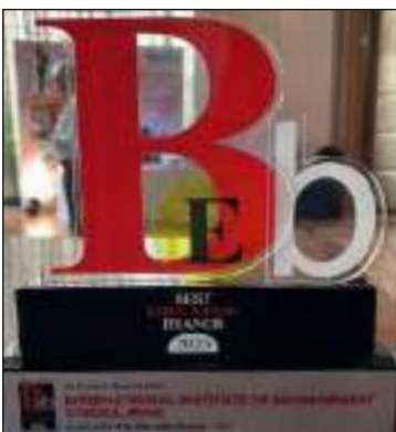
BEST EDUCATION BRANDS THE ECONOMICS TIMES 2023