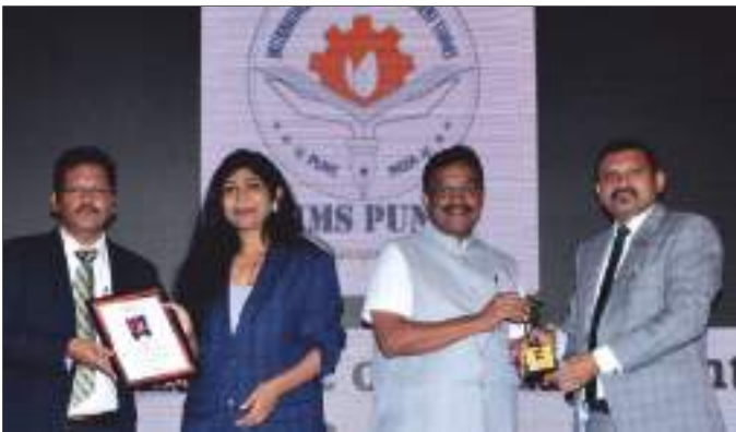
"Best Education Brands 2018" - The Economic Times