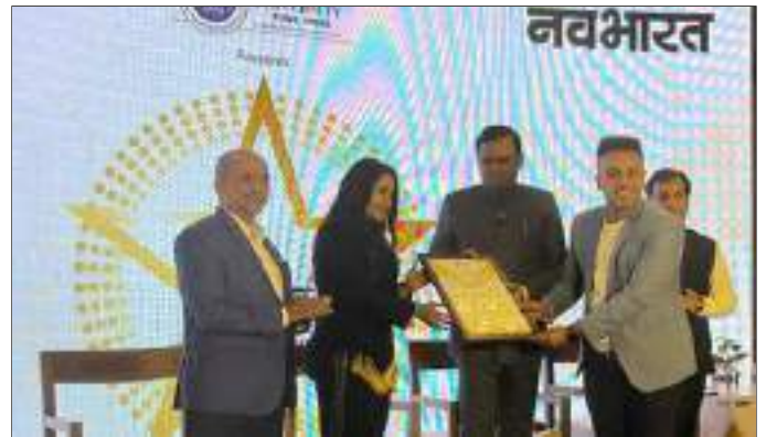
"Best B-School In Placements", Navabharat Group 2023