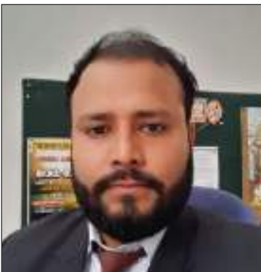
Prof. Israr Ahmed