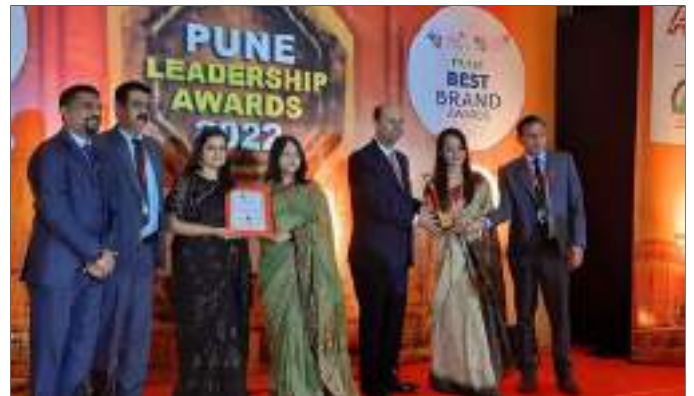
"Best B-School In Placements", Pune Education Leadership Award, 2022