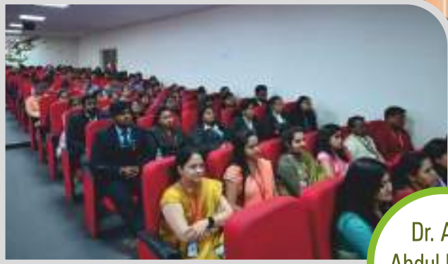
Dr. APJ Abdul Kalam Auditorium