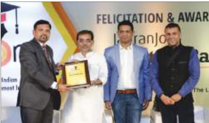
Top Management Institute in Western Region - Jagran Josh