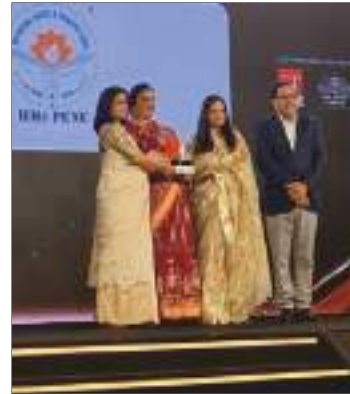
Best Education Brands, The Economics Times - 2024