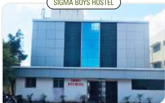
SIGMA BOYS HOSTEL