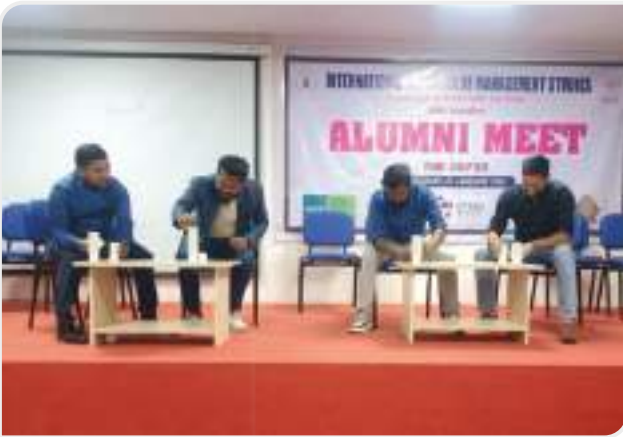
Alumni Meet - Pune Chapter - 27/01/2024