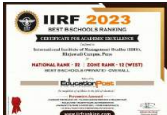
IIRF B SCHOOL RANKING 2023