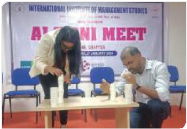
Alumni Meet -Hyderabad Chapter - 20/01/2024