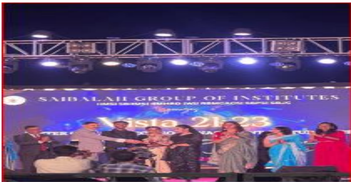
On 23rd Feb 2023, SaiBalaji Education Society organized an "AD-MAD competition" Here are some glimpses from the event.