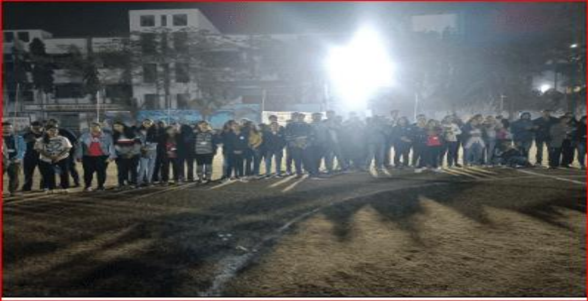
REPUBLIC DAY CELEBRATION-26.01.2023