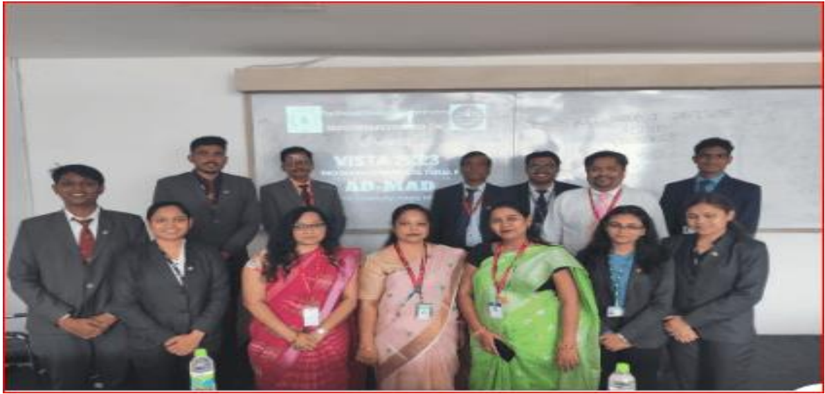
IIMS organised one day freshers event