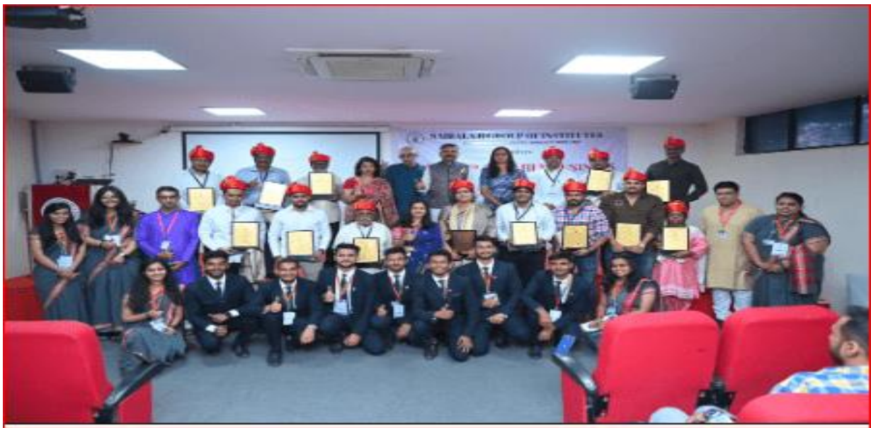
INTERNATIONAL WOMEN'S DAY CELEBRATION-8.03.2023