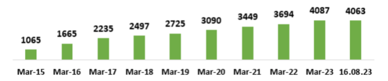
Number of Rupay Debit Cards issued in PMJDY accounts (in crore)